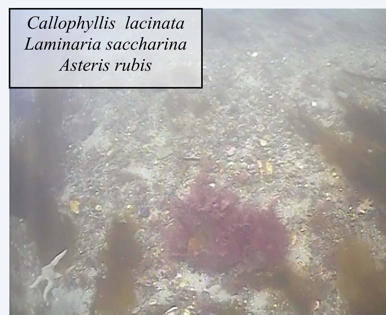
Callophyllis lacinata Laminaria saccharina Asteris rubis