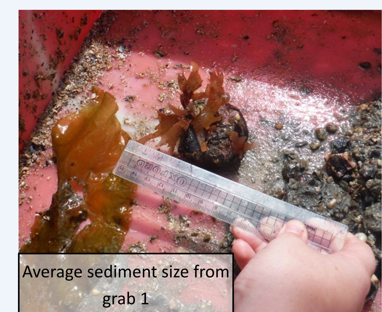
Average sediment size from grab 1